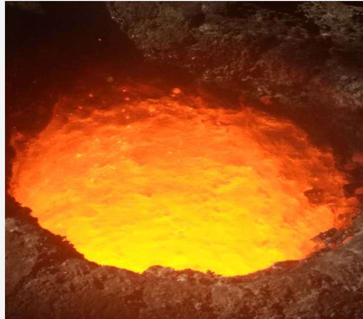
After 2 Redux additions

Manufacturer of Redux EF40L recommends that Redux be Used continuously to show Refractory Life increases of 75 to 200%