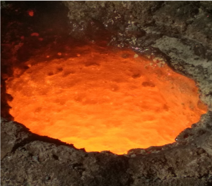
Initial Furnace Condition