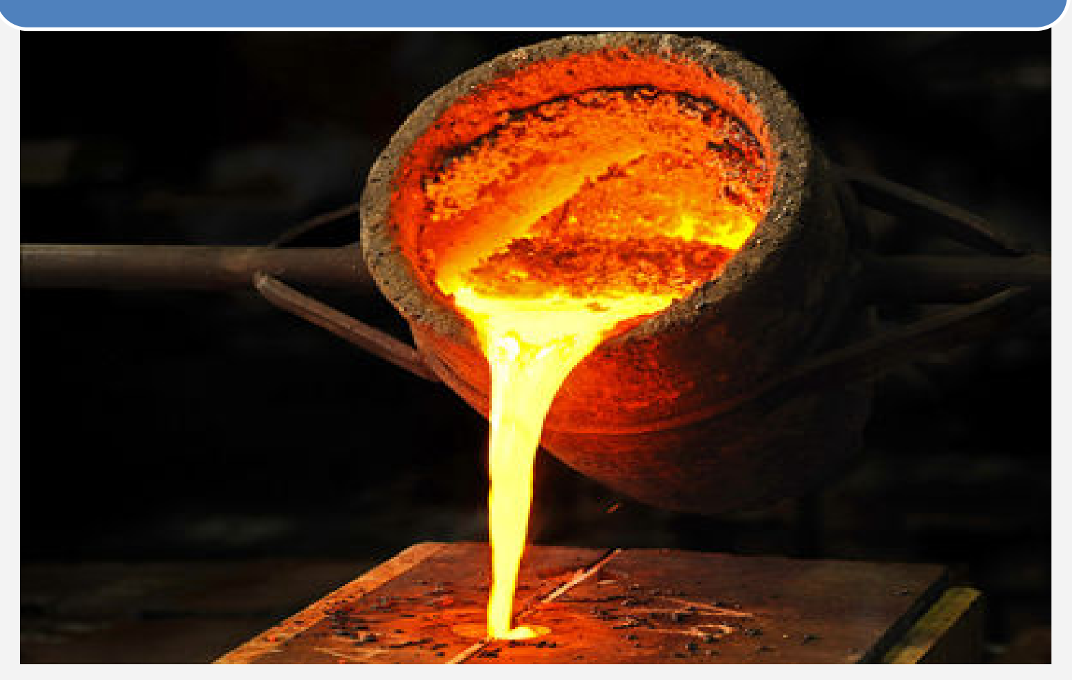
REDUX EF40L at International Foundry "H" Producing Grey and Ductile Iron Castings

Case Study 8 - REDUX EF40L Objective: Clean slag build-up from Coreless Induction furnace walls